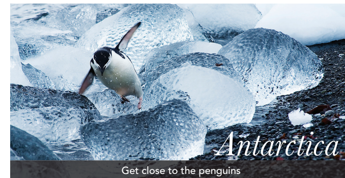
Get close to the penguins

ARCTIC SPITSBERGEN Are you a real explorer? If the answer is yes, then Hurtigruten's outstanding Spitsbergen Expedition Voyages can take you to the last wilderness in Europe. Remote, mysterious and extreme, the island of Spitsbergen is Norway's outpost in the High Arctic. You'll sail aboard the luxurious yet intimate MS Fram, our 318-passenger "flagship." These incredible voyages follow in the footsteps of Arctic pioneers and intrepid whalers, sailing beneath skies that echo to the cries of countless seabirds as we cross ocean landscapes of gigantic ice sculptures and remote bays brimming with seals and walruses, whales and Polar bears. Hurtigruten's Zodiac and PolarCirkel boat landings, knowledgeable expedition guides, and fascinating lectures create an intimate and memorable learning experience in one of most unspoiled spots on Earth.