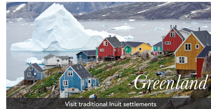
Visit traditional Inuit settlements

NORWAY For 120 years, Hurtigruten has shared the wonders of our homeland on the Norwegian Coastal Voyage. Whether guests choose the classic 7-day Northbound, 6-day Southbound or 12-day Round-trip voyage-what better way to experience the Land of the Midnight Sun and Northern Lights? Making year-round calls at 34 ports, Hurtigruten opens remote treasures such as the unspoiled Lofoten Islands, with their red and gold cabins and brilliant white-sand beaches; the Trollfjord's narrow rocky gateway; and Finnmark, home to an austere landscape and the indigenous Sami people. Each year, thousands of passengers are dazzled by "The World's Most Beautiful Voyage," exploring Norway's coastal communities and meeting its hardy, hospitable residents. You, too, can soar with the Sea Eagles and ply the fjords of the Vikings-in comfort and style with Hurtigruten.