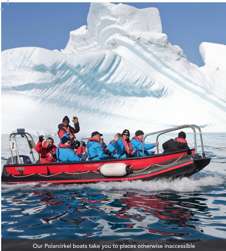
Our Polarcirkel boats take you to places otherwise inaccessible