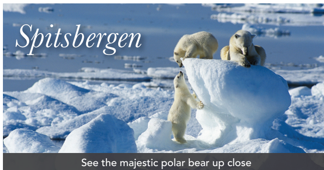
See the majestic polar bear up close

Whether it's our daily departures from Bergen, crossing the Arctic Circle to sail deeper into the heart of Norway's spectacular landscape beneath the dazzling brilliance of the Midnight Sun or the Northern Lights, or our sailings farther afield, to the striking polar vistas of Spitsbergen and Greenland, intriguing and exciting European ports or remotest reaches of exotic Antarctica, Hurtigruten brings you Norwegian hospitality, seaborne expertise and the world's most breathtaking destinations.