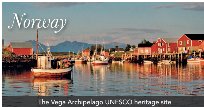
The Vega Archipelago UNESCO heritage site

NORWAY For 120 years, Hurtigruten has shared the wonders of our homeland on the Norwegian Coastal Voyage. Whether guests choose the classic 7-day Northbound, 6-day Southbound or 12-day Round-trip voyage-what better way to experience the Land of the Midnight Sun and Northern Lights? Making year-round calls at 34 ports, Hurtigruten opens remote treasures such as the unspoiled Lofoten Islands, with their red and gold cabins and brilliant white-sand beaches; the Trollfjord's narrow rocky gateway; and Finnmark, home to an austere landscape and the indigenous Sami people. Each year, thousands of passengers are dazzled by "The World's Most Beautiful Voyage," exploring Norway's coastal communities and meeting its hardy, hospitable residents. You, too, can soar with the Sea Eagles and ply the fjords of the Vikings-in comfort and style with Hurtigruten.